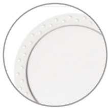
SCAPB BEADED FRAME